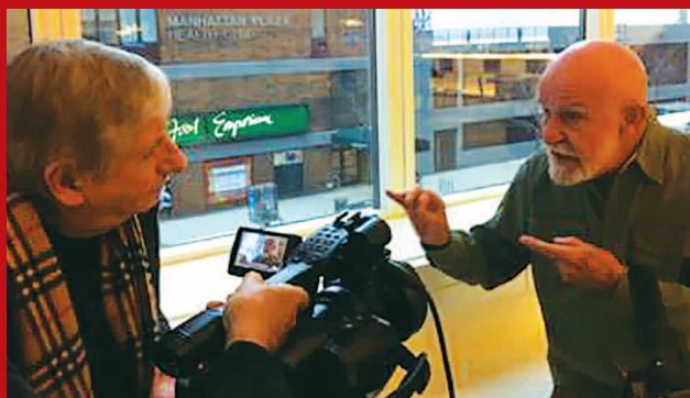
Tony Palmer interviewing Athol Fugard

Tony Palmer is one of the leading directors of documentaries about performers in the world. Among over 40 international prizes for his work are 12 Gold Medals from the New York Film Festival, as well as numerous BAFTAs and Emmy Awards. Palmer is the only director to have won the Prix Italia three times.